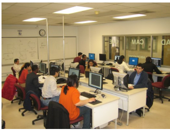
Computer Aided Design Laboratory