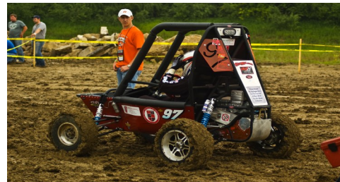
Meet SAE students and see the SAE Baja Vehicle in room MEC 216