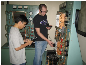
Thermodynamics/ Fluids Laboratory