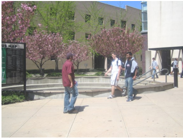
Mechanical Engineering Center